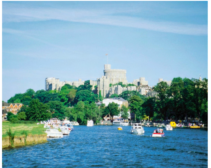
Windsor Castle with the River Thames in the foreground